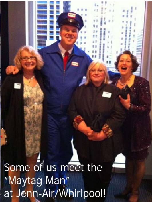
Some of us meet the "Maytag Man" at Jenn-Air/Whirlpool!